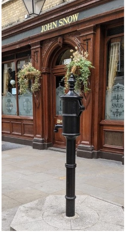
(A replica of the original Broad Street (now Broadwick Street) pump, now stands in front of the John Snow pub.)