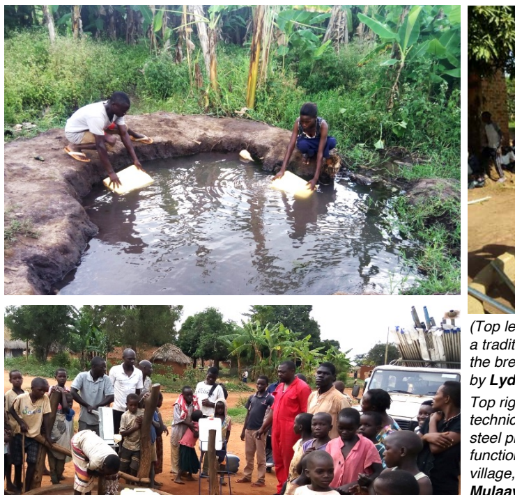
(Top left: Two women collect water from a traditional well in Luwero, following the breakdown of their borehole.

Top right: Masked saviours: B.T. technicians insert top quality stainless steel pipes into a previously nonfunctioning borehole in Bunyaaka village, Luwero.